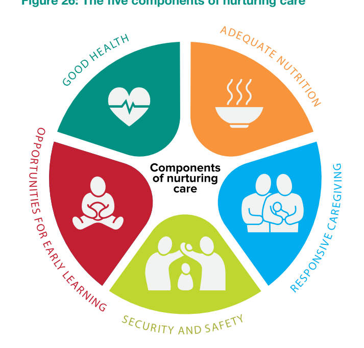
Figure 26: The five components of nurturing care

These two documents provide a useful lens for considering how the South African health sector has, and should, respond to the imperative to use the first 1,000 days as a platform to ensure that children not only survive, but thrive.