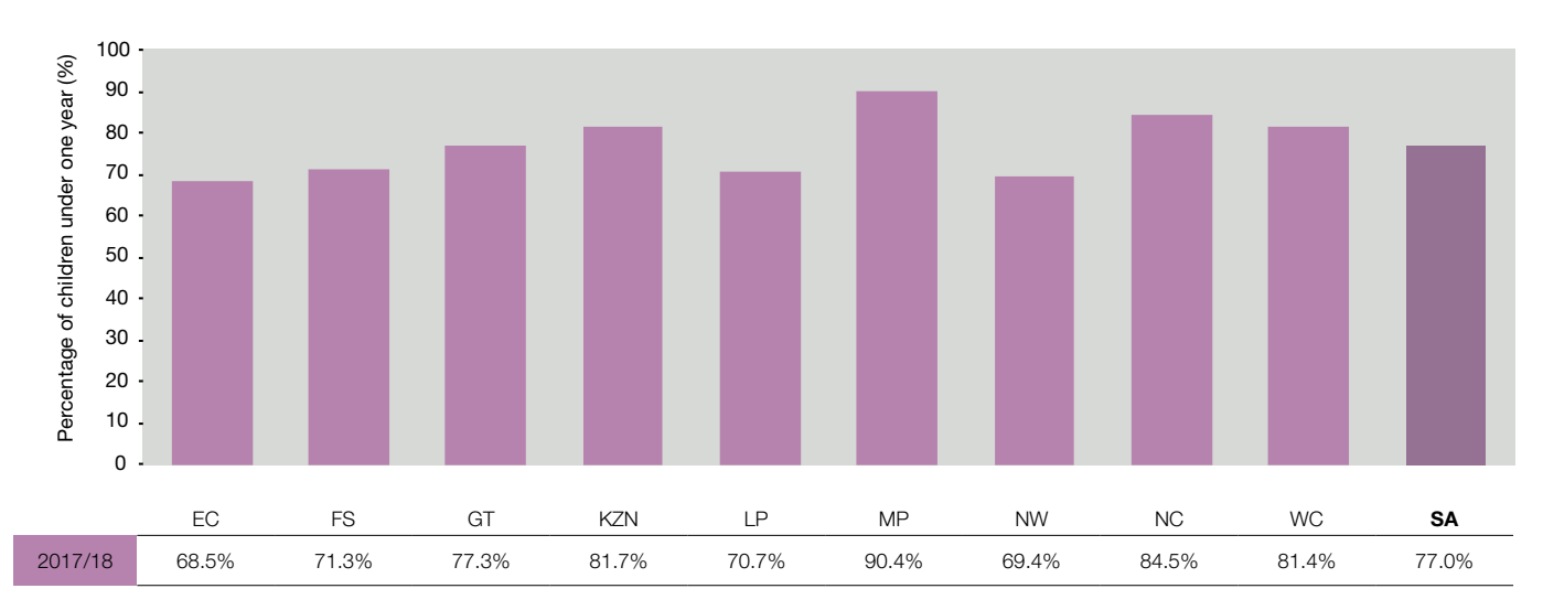
Figure 3b: Immunisation coverage of babies younger than one year, by province, 2017/18

The challenge of national and provincial aggregates is that they can mask differences between districts and hide areas with low coverage. District coverage is available in the 2017/18 District Health Barometer where 29 of the 52 districts show coverage below the national average. Coverage for individual districts demonstrates significant inter-district inequities in service access for young children – ranging from a low coverage rate of 56% in the Sarah Baartman District Municipality of the Eastern Cape, to 98% in the eThekwini Metropolitan Municipality in KwaZulu-Natal. Low coverage rates are concentrated mainly in poorer districts, where health needs may be greatest.