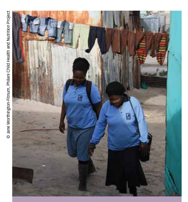
Philani Mentor Mothers visit homes and support mothers and children in their community.

Parenting children with serious illness, injury, disability and emotional and behavioural difficulties can result in higher levels of psychological distress in caregivers. A lack of material and social support and poor access to appropriate services escalates caregiver stress.<sup>17</sup>