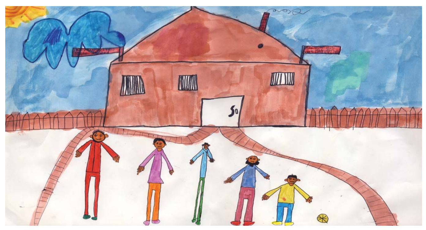
i There are approximately 1.6 million maternal and double orphans living with family members. Of these, 1.1 million are living in similar conditions of poverty as child SS, and are in need of an adequately valued social assistance grant. (Statistics South Africa (2010) General Household Survey 2009. In: Hall K & Proudlock P (2011) Orphaning and the Foster Child Grant: Return to the 'Care or Cash' Debate. Children Count brief, July 2011. Cape Town: Children's Institute, UCT.) The GHS 2011 shows a small increase in the number of maternal and double orphans (see p. 84).

A comprehensive solution to the foster care crisis for the many orphans living with extended family requires the government to choose the most efficient and rights-based mechanism to provide an appropriate and adequate social grant, as well as a mechanism