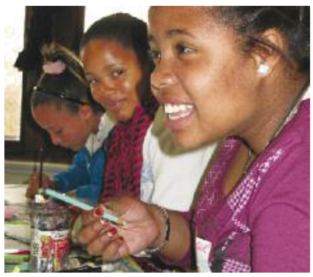
Art workshop: Discussing children's experiences of participation

The law requires that anyone taking a decision that affects a child or group of children has to make sure the best interests of the child are the key – or one of the key – considerations. A child's best interests are influenced by many factors, including a child's experiences, opinions and wishes. Therefore, it is essential that the decision-maker consults the child to determine the child's best interests. That does not mean that adults must follow children's wishes but that they must listen to children, consider what they say, take their opinions seriously and give them feedback on what they have decided, and why.