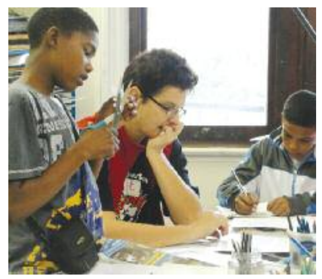
Artists at work: Drawing participation in different settings

States Parties shall assure to the child who is capable of forming his or her own views the right to express those views freely in all matters affecting the child, the views of the child being given due weight in accordance with the age