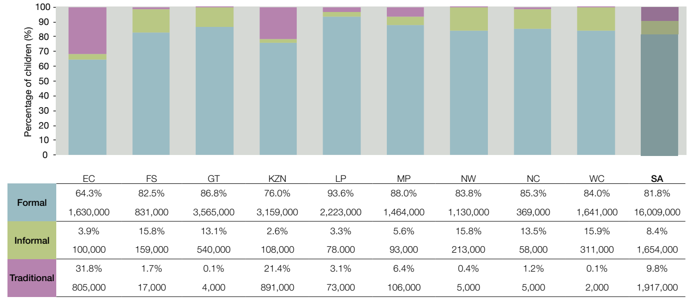
Figure 5b: Children living in formal, informal and traditional housing, by province, 2017